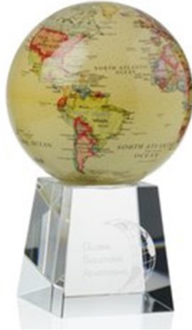
Stuart Semple award